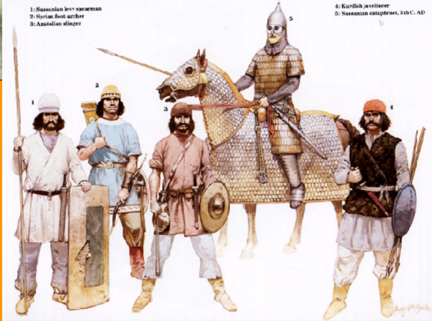
4: Kurdish javellancer 5: Sasanian cataphract, 3th C. AD